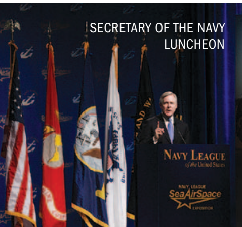
SECRETARY OF THE NAVY LUNCHEON