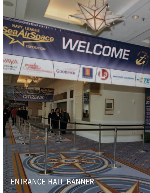
ENTRANCE HALL BANNER