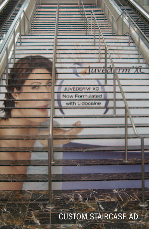
CUSTOM STAIRCASE AD